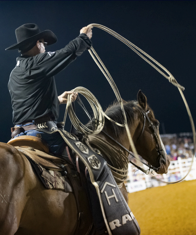
INTERNATIONAL RODEO COMPETITION