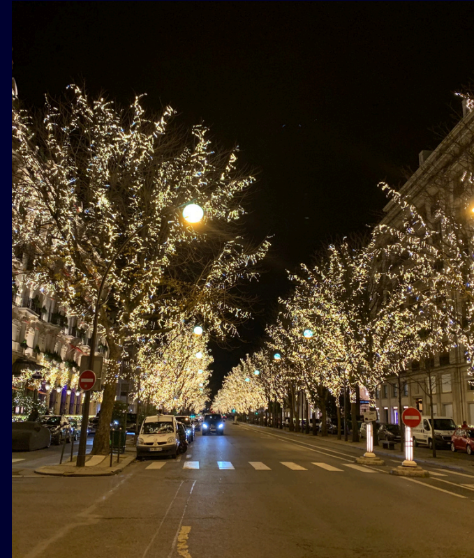
MIDNIGHT LIGHTING CEREMONY